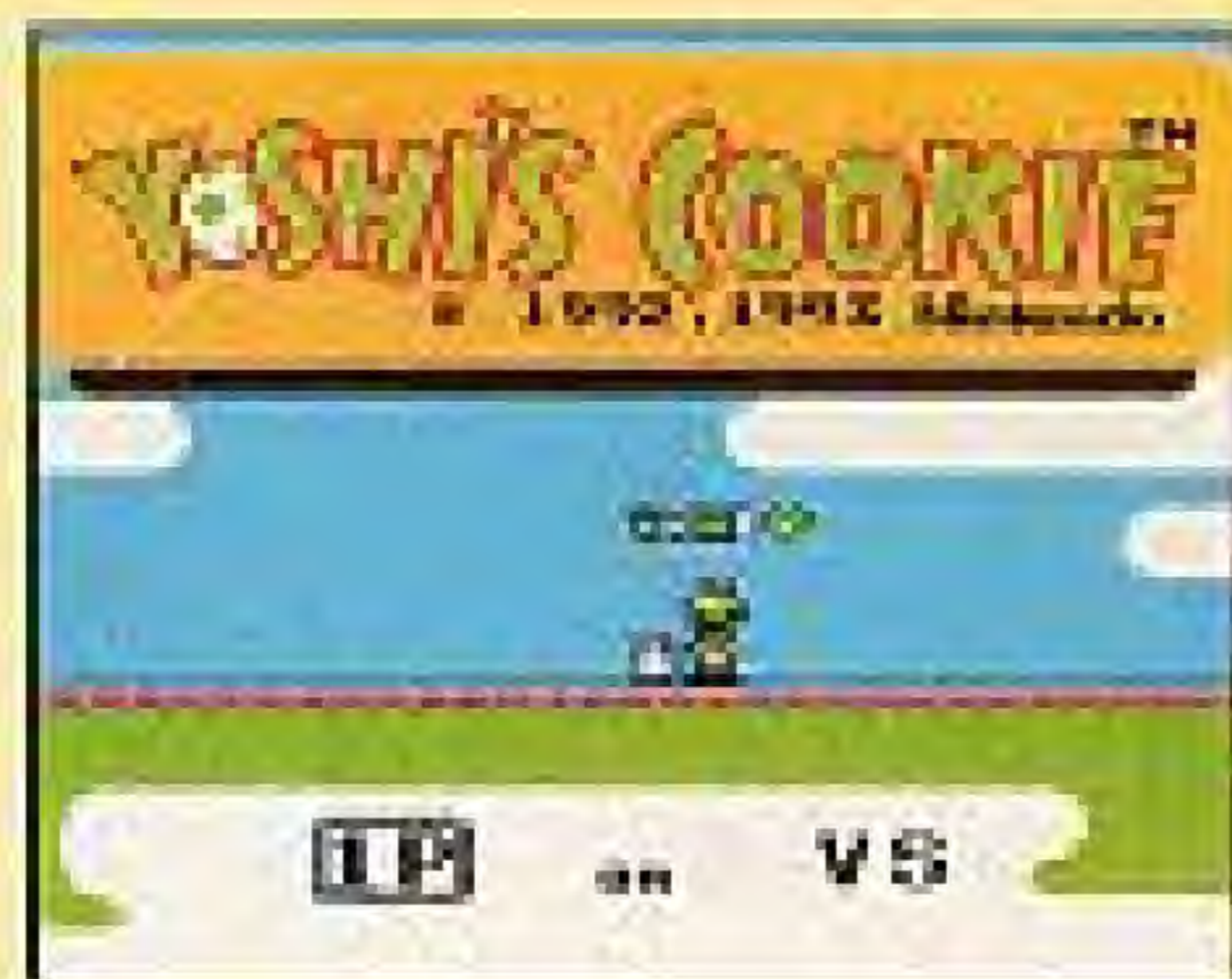
Menu Screen 1-Player Game

Use either the \leftarrow Control Pad or the SELECT Button to select the 1P (1-player) or VS. (2-player) games. Then press the START Button to display the menu screen.